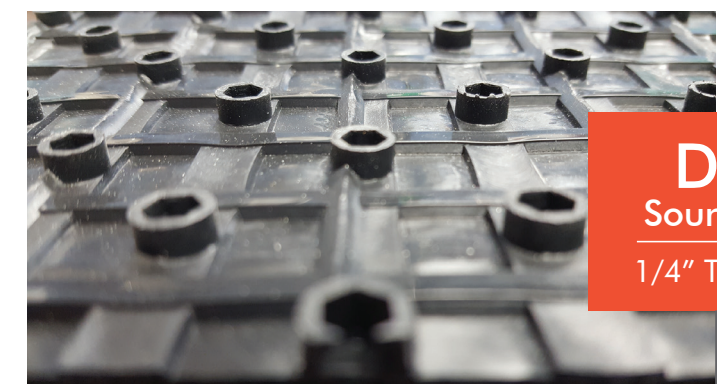
D25 Sound Mat 1/4" Thickness