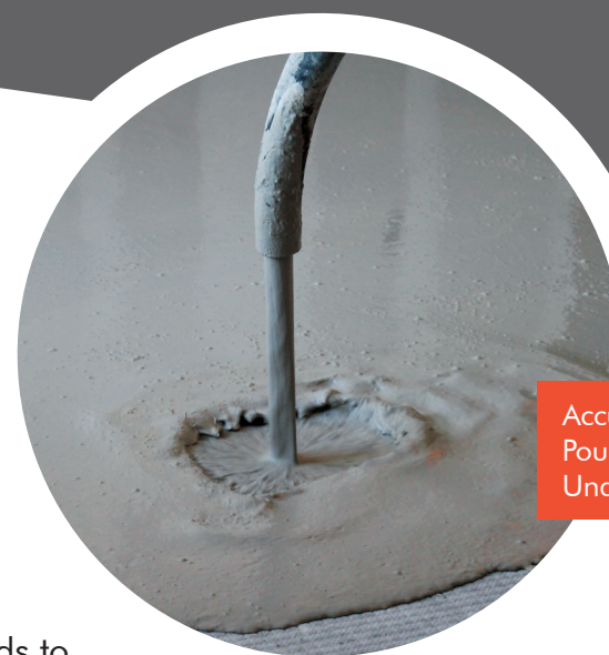
AccuCrete® Pourable Underlayment

AccuQuiet® sound mats are loose-laid over the subfloor and then covered with a uniform thickness of AccuCrete® Pourable Underlayment. No mechanical fastening is required.