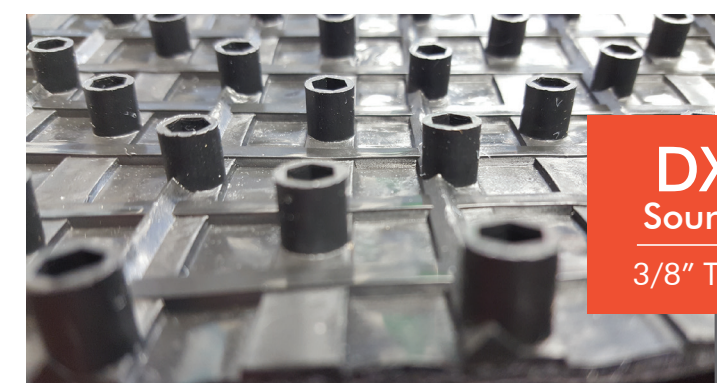
DX38 Sound Mat 3/8" Thickness